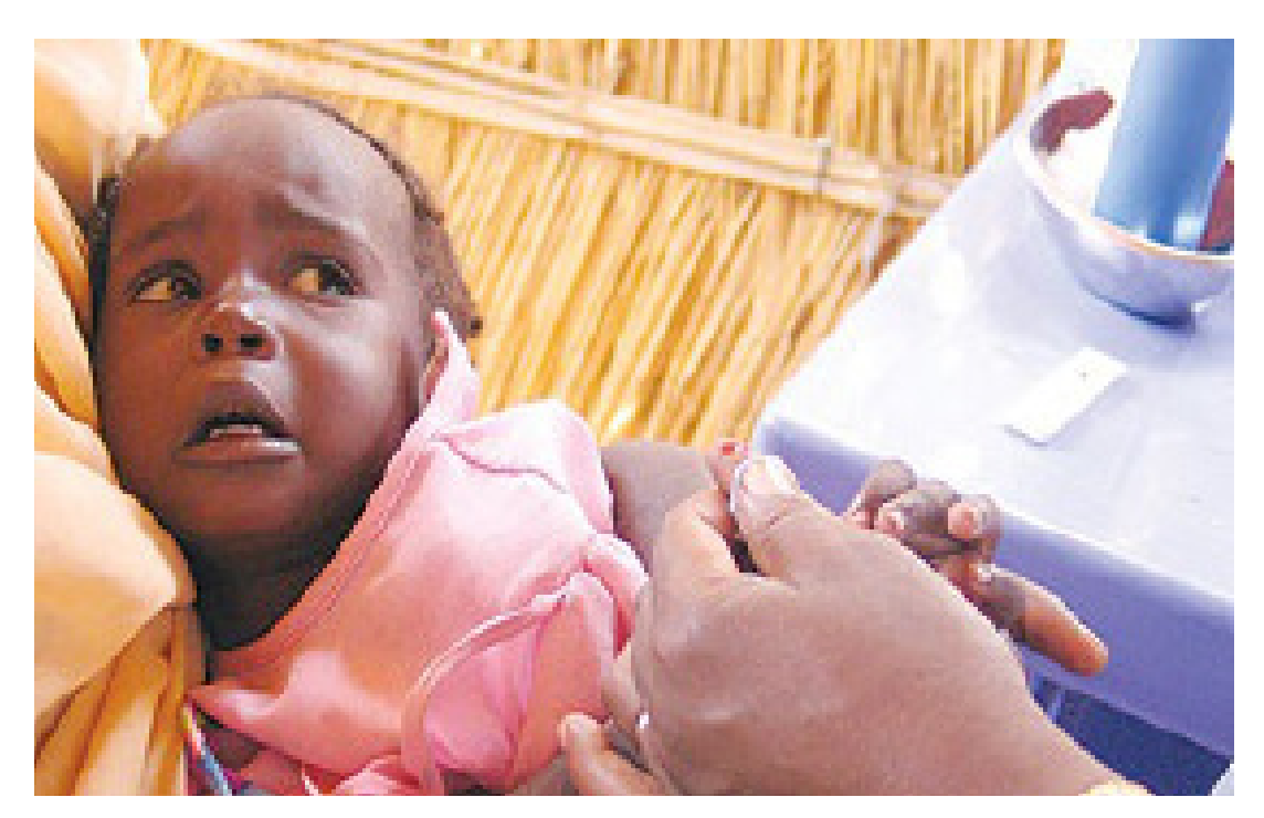
Rapid Diagnostic Test (RDT)

THE SOONER YOU BEGIN TREATMENT, THE SOONER YOU WILL GET BETTER