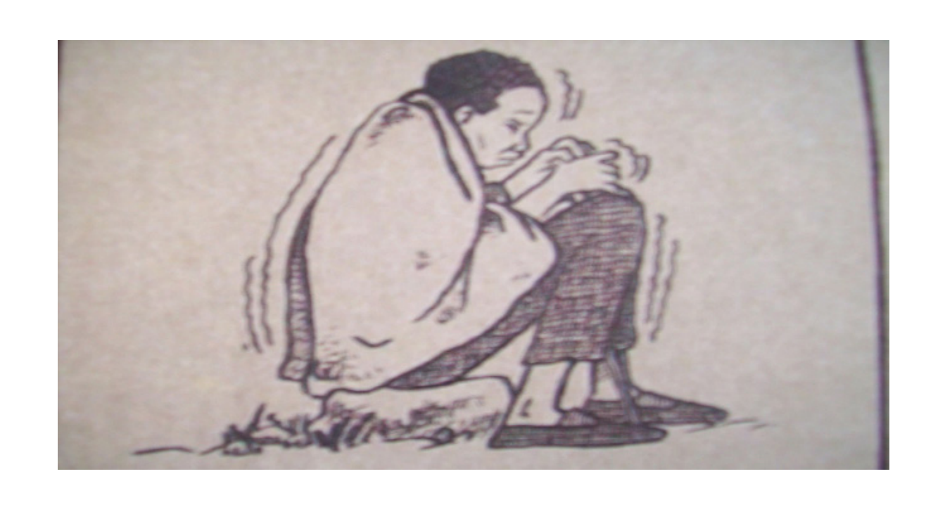
A RAPID DIAGNOSTIC TEST COULD HELP CONFIRM MALARIA